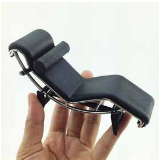
1:6 scale model of Le Corbusier Lounge Chair . See https://www.vitra.com/en-us/product/miniatures-collection for more examples.

We all know 1/6" scale, it's "Barbie Doll scale". You can check yourself, as you build your chair model, by putting a Barbie or Ken doll next to your model.