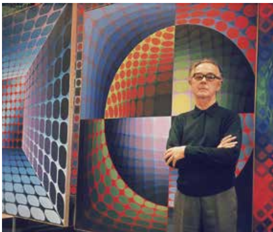
Victor Vasarely and his paintings

Please print in slices and splice them together if you want to use the college printer.