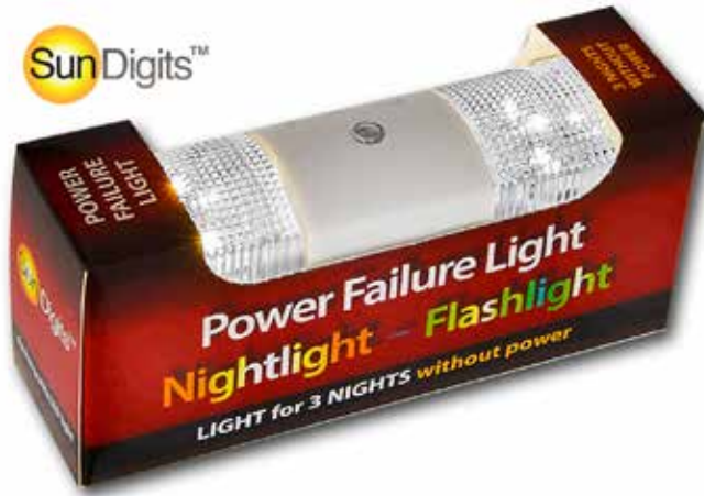
Package design by Martin Saint-Martin for SunDigits. Note use of gradients and type as clipping mask for artwork.

Walk into a supermarket. There are, literally, thousands of designs screaming, "Look at me! BUY ME!"